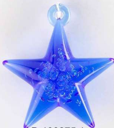
D 190875 1