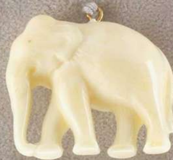
A 101175 EPX