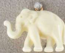
A 170377 EPX