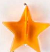
P 1691 21