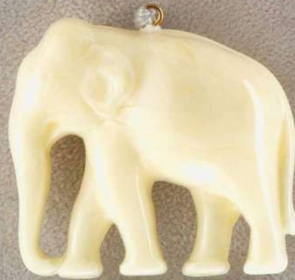
A 310377 EPX