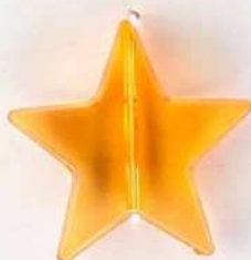
P 1691 28