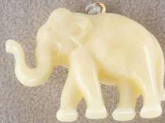
A 130376 EPX