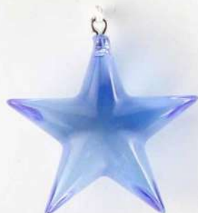
A 2886 35