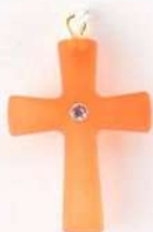
A 020302 S