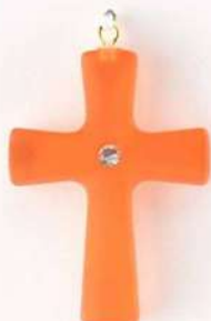
A 020303 S