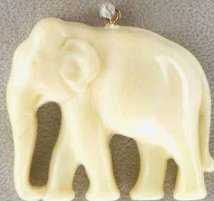
N 956 PX