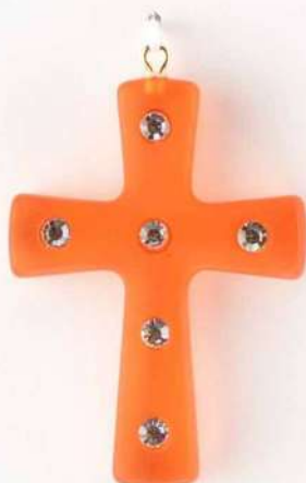
A 50375 S6